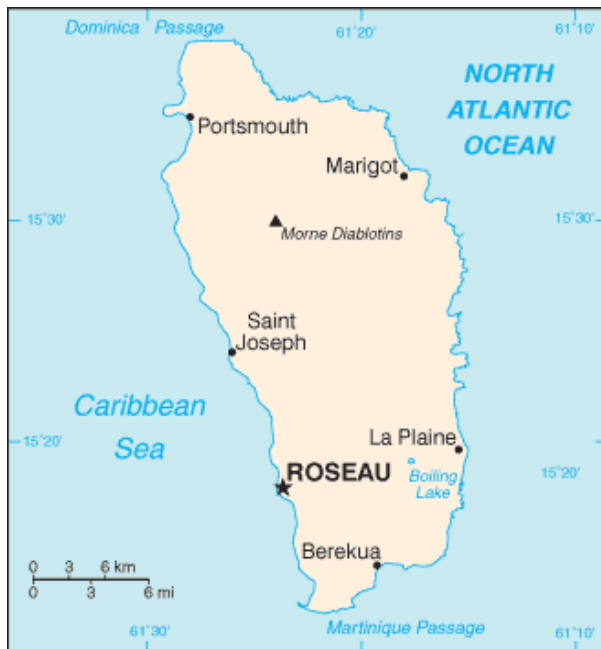
Map of the Dominica